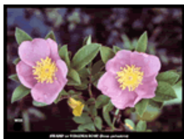
Virginia Rose (Rosa palustris)