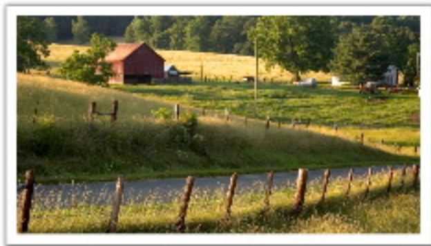
Country Road, Bobby Carlsen. © 2006 All rights reserved.